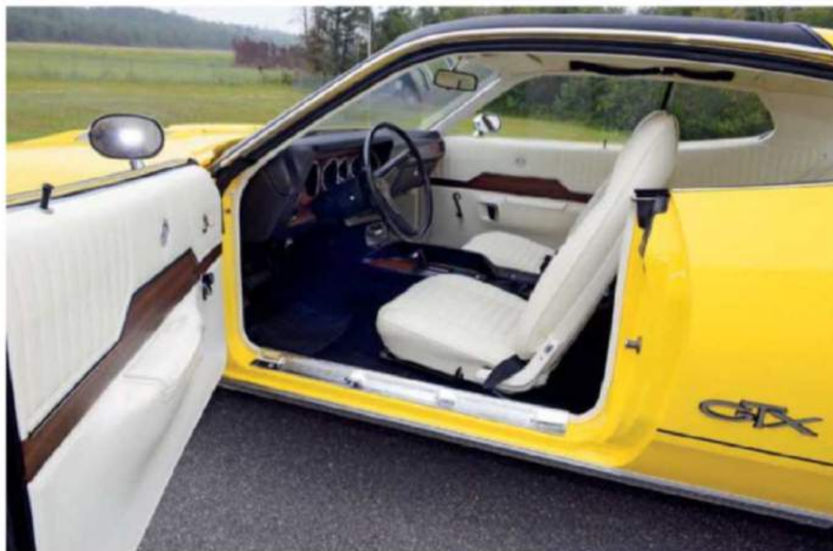
■ Two-tone black and white interior is gorgeous. The dash pad is original to the car.