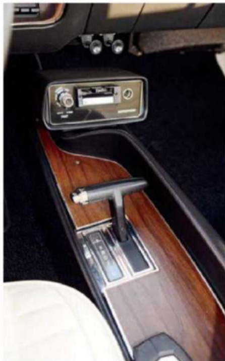
■ This view of the console gives you a good look at the cassette player with the dictaphone option.

pile, was scheduled for a better-than-new makeover.