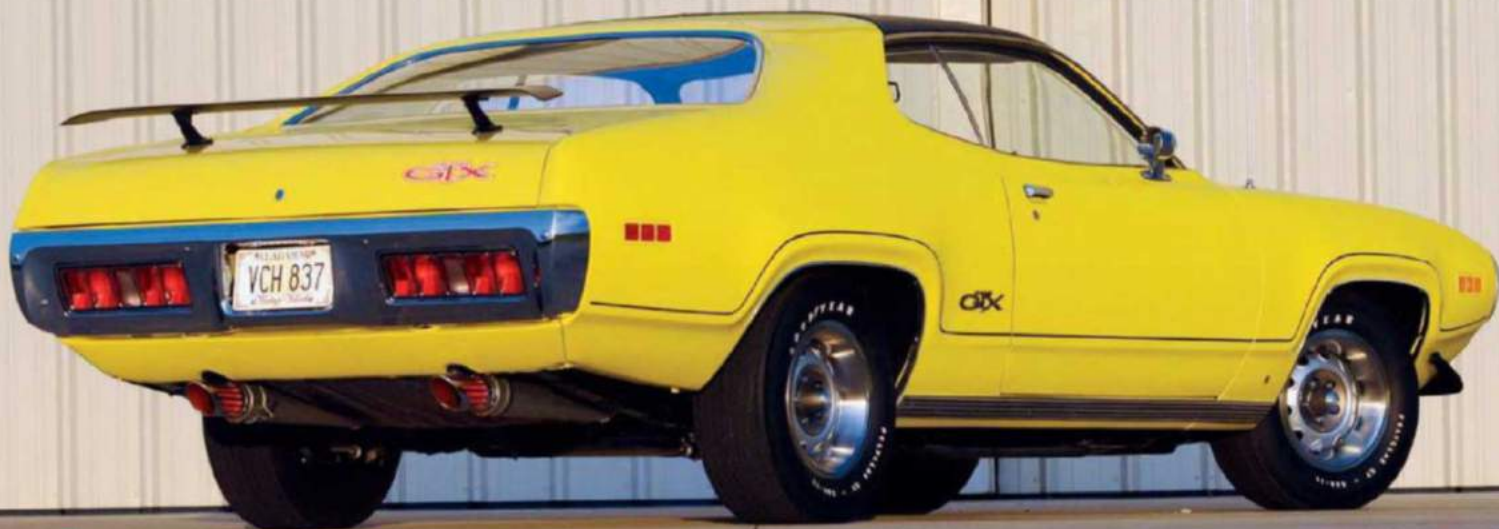
■ Despite the handsome “fuselage” restyling and high-performance engine options that included the Six Barrel and Hemi, sales of the GTX dropped significantly—to just 3,212—for the '71 model year. This one, now in the Wellborn Musclegar Museum, was originally sold in Canada.